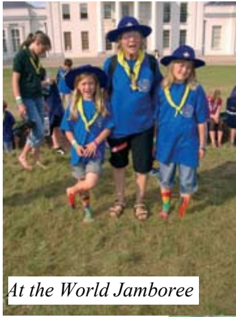
At the World Jamboree