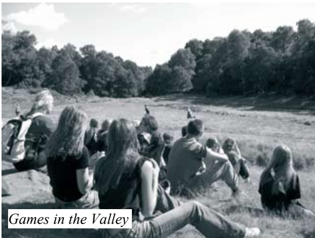
Games in the Valley

After a well earned rest and breakfast the Danish, German and Polish Scouts started previously-arranged activities for the day. The Danish and German Scouts and their leaders left Rhydd Covert to