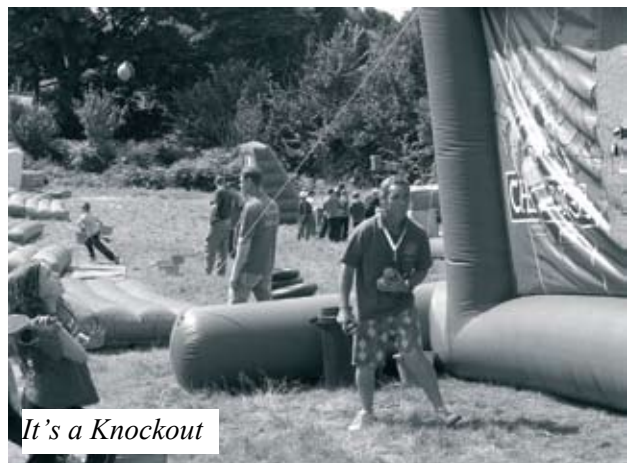
It's a Knockout

Wednesday was the day that members of the Scouting movement across the world linked together to re-dedicate themselves by renewing their Promise. From 8.00am Rhydd Covert was video-linked, courtesy of the DRP Group from Hartlebury, to Brownsea Island, the site of Lord Baden-Powell's first