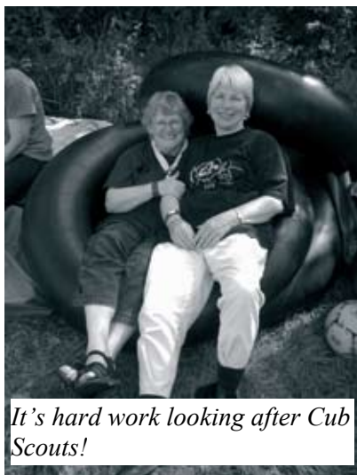
It's hard work looking after Cub Scouts!

Friday was an early start with over 30 coaches departing the Safari Park at 6.00 am to take everyone on a day trip to the World Scout Jamboree at Hylands Park in Essex. The size of the camp and the huge range of nationalities represented was mind boggling!! Fields full of tents gave some idea of the