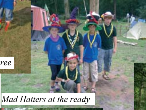
Mad Hatters at the ready