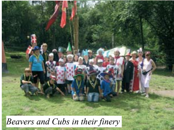
Beavers and Cubs in their finery