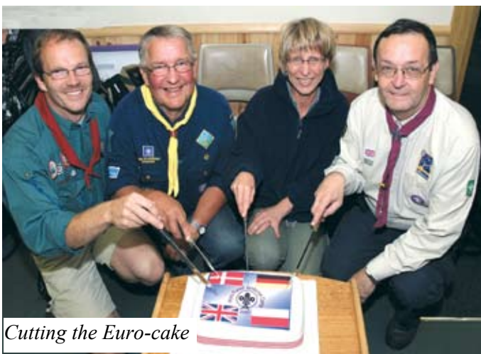
Cutting the Euro-cake