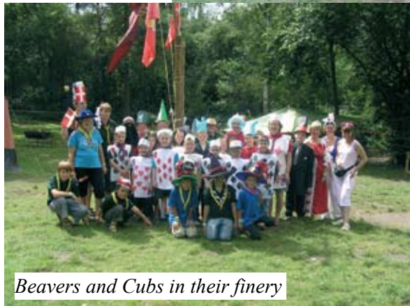
Beavers and Cubs in their finery