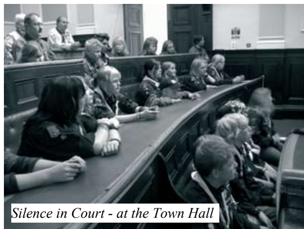
Silence in Court - at the Town Hall

“Stjerne Gruppe”, the combined Boy Scout and Girl Guide group belonging to the Danish minority in Husum, took part in the camp after being invited by the 8 th Kidderminster St. John’s Scout Group. We had heard a lot about the heavy rain in England in