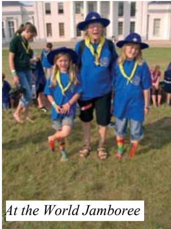
At the World Jamboree