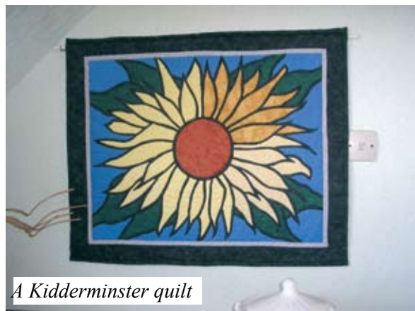
A Kidderminster quilt