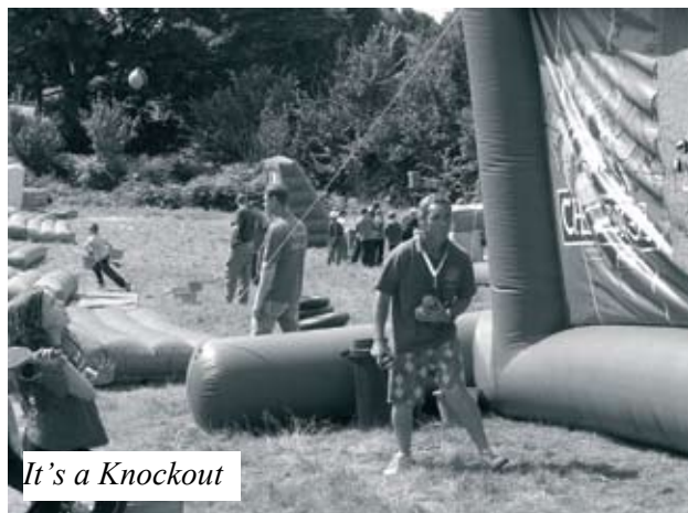
It's a Knockout

Wednesday was the day that members of the Scouting movement across the world linked together to re-dedicate themselves by renewing their Promise. From 8.00am Rhydd Covert was video-linked, courtesy of the DRP Group from Hartlebury, to Brownsea Island, the site of Lord Baden-Powell's first