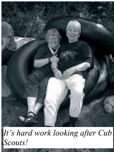
It's hard work looking after Cub Scouts!

Friday was an early start with over 30 coaches departing the Safari Park at 6.00 am to take everyone on a day trip to the World Scout Jamboree at Hylands Park in Essex. The size of the camp and the huge range of nationalities represented was mind boggling!! Fields full of tents gave some idea of the