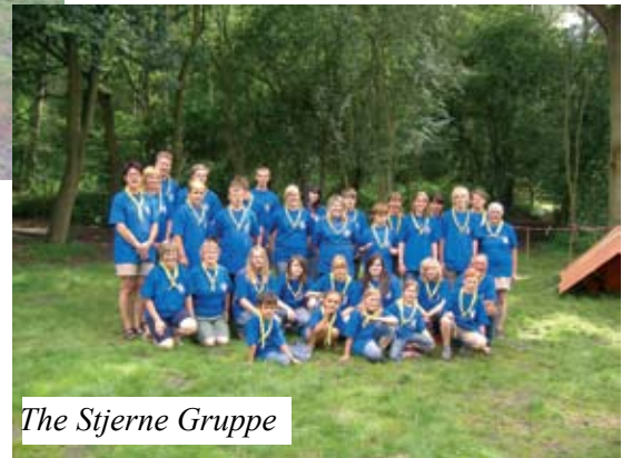
The Stjerne Gruppe