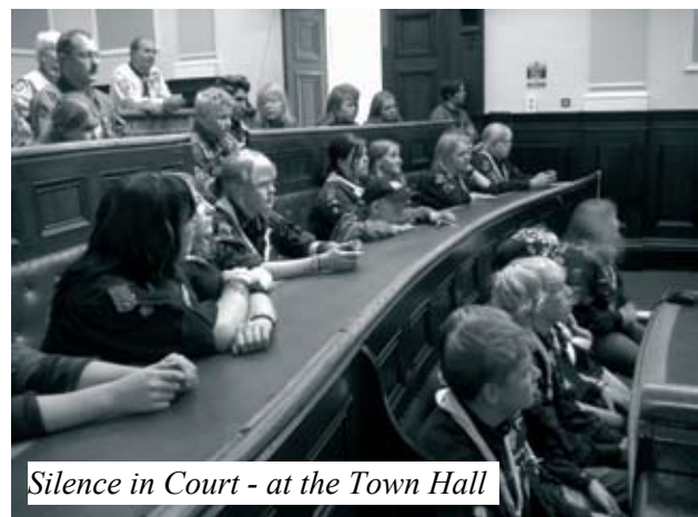
Silence in Court - at the Town Hall

“Stjerne Gruppe”, the combined Boy Scout and Girl Guide group belonging to the Danish minority in Husum, took part in the camp after being invited by the 8 th Kidderminster St. John’s Scout Group. We had heard a lot about the heavy rain in England in