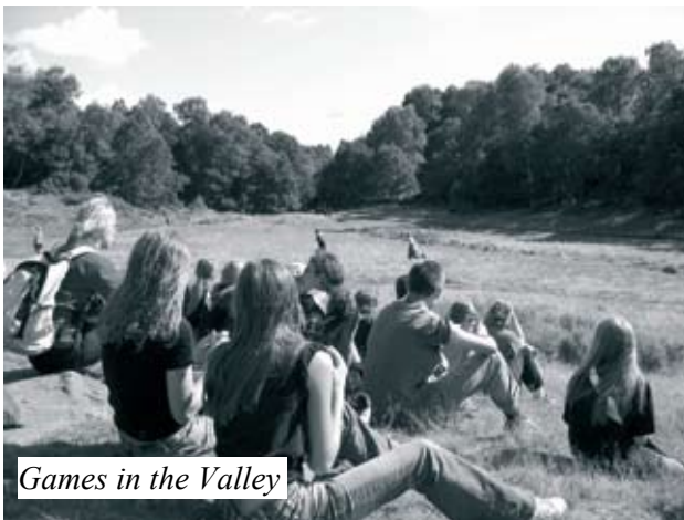
Games in the Valley

After a well earned rest and breakfast the Danish, German and Polish Scouts started previously-arranged activities for the day. The Danish and German Scouts and their leaders left Rhydd Covert to