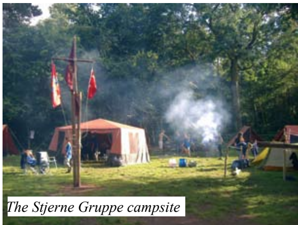
The Stjerne Gruppe campsite